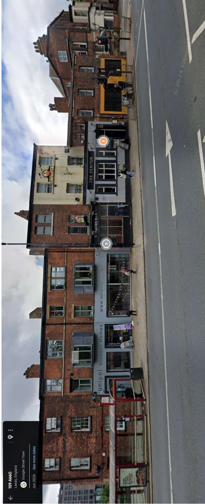
Appendix 1 - Photograph A